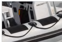
Boarding wear patches