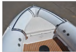
Bow rail (4.8, 4.8T only)