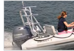
Antenna arch with integrated swim ladder