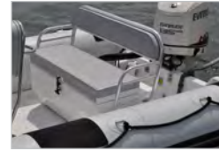
Three person bench seat with integrated cooler