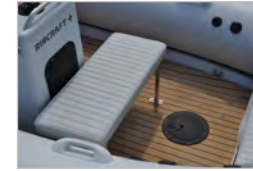
Forward bench seat (4.8T only)