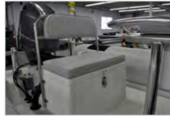
Two person bench seat