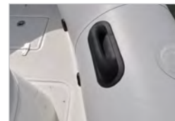
Tube grab handles